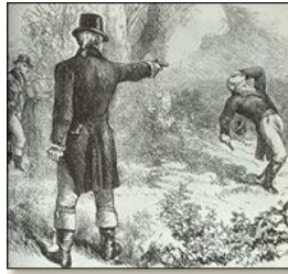
Eyewitness 2 Hamilton's Second