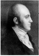
Eyewitness 1 Burr's Second

(Why might two people arrive at different interpretations of the same event?)